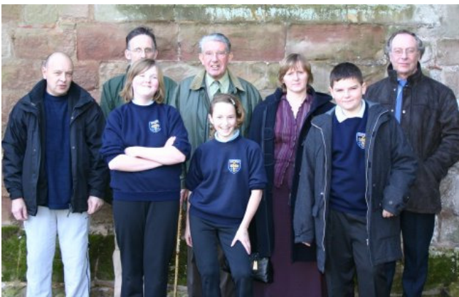
Alvechurch ringers by the tower

The bells would be of little use without the ringers. The ringing team has always represented a wide cross-section of village life. The current team range from schoolchildren to pensioners and all give their time to make sure that the bells continue to ring across Alvechurch.