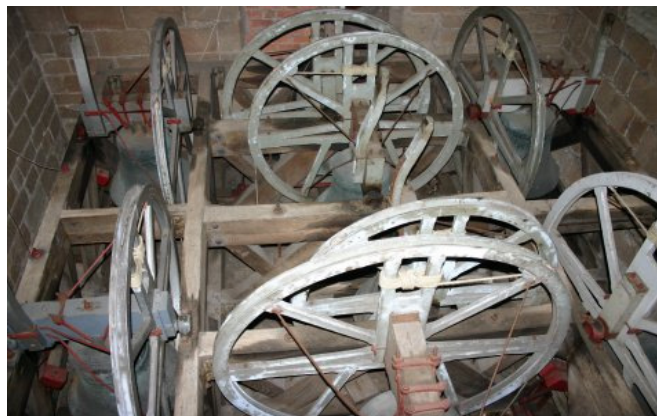
The bells in the tower at St Laurence